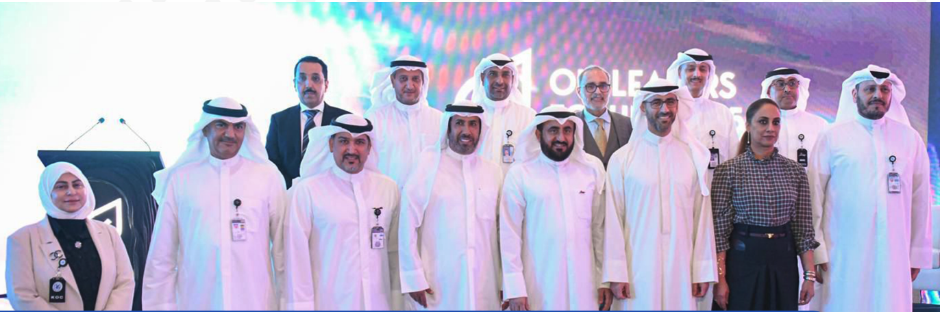
KOTC Organizes the Annual Forum for the Leadership of KPC and Subsidiaries