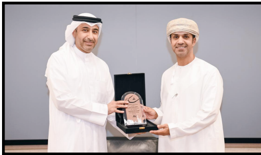
Training Program and Induction Lecture on International Etiquette, Protocol, and the Art of Dialogue