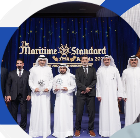
KOTC Achieves Environmental Protection Award from The Maritime Standard