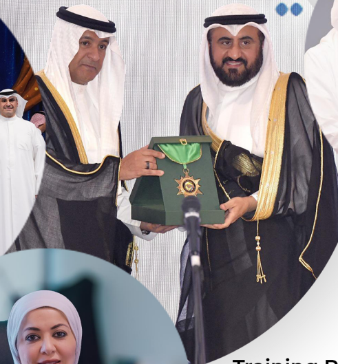
KOTC Honored by the Executive Office of the GCC Council of Ministers of Labour and Social Affairs