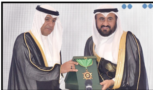
KOTC Honored by the Executive Office of the GCC Council of Ministers of Labour and Social Affairs