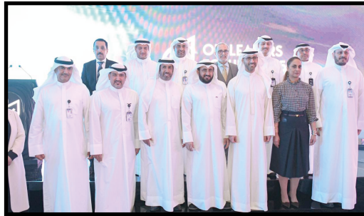
KOTC Organized the Annual Forum for the Leadership of KPC and Subsidiaries