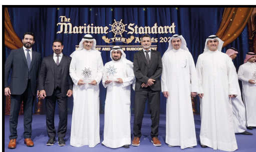
KOTC Achieves Environmental Protection Award from The Maritime Standard